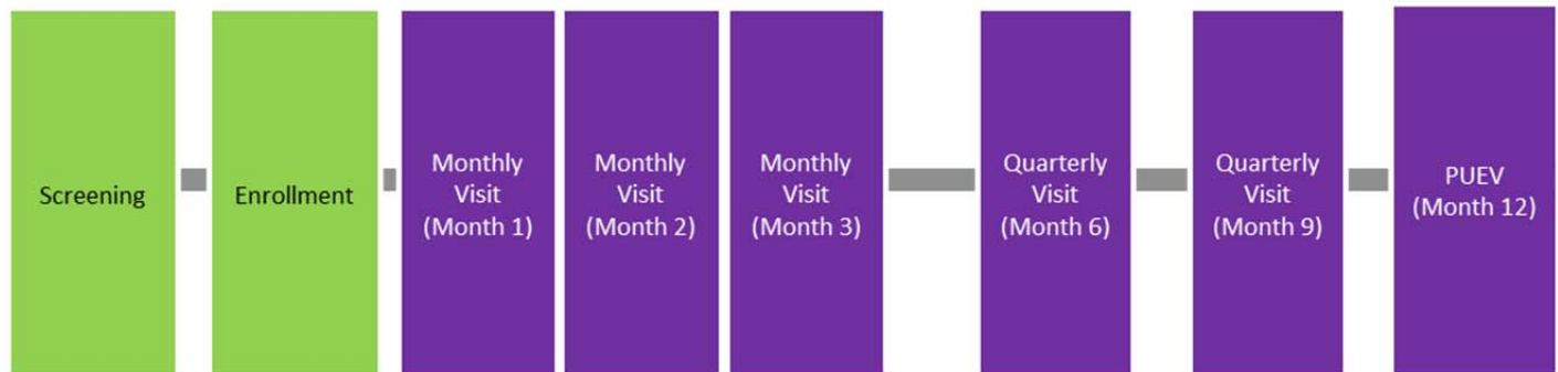
Figure 1: Sample Study Visit Schedule

The study follow-up schedule will be monthly for the first three months, then quarterly thereafter (Figure 1), reflecting a transition to a more real-world type of follow-up (versus a clinical trial approach) that would be important for informing implementation.